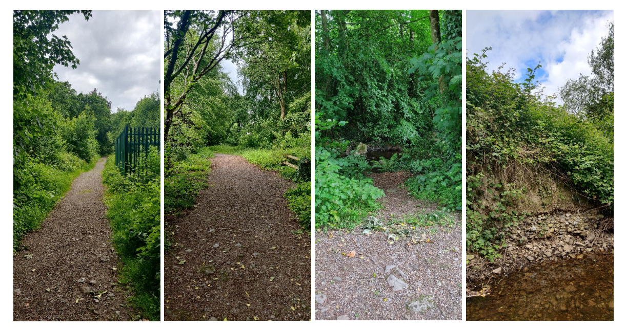
Apx Figure 10: Photographs of Proposed Scheme area showing from left to right gravel path into Brittas wood (Area 1), location of Brittas Stream culvert under the gravel path (Area 1), path down to River Clodiagh near the proposed debris trap (Area 1) and eroding bank on the River Clodiagh just upstream of Area 3. Photographs taken on 6<sup>th</sup> June 2024.