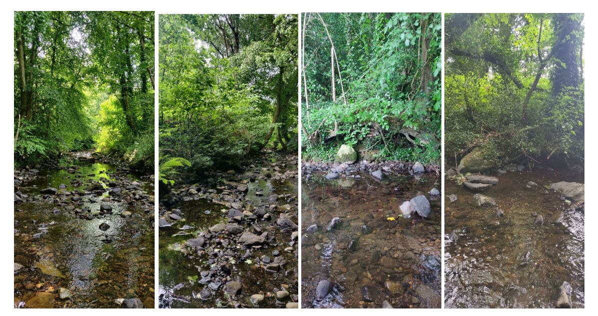
Apx Figure 3: Photographs of the proposed debris trap location in low flow. From left to right: upstream view, downstream view, right bank, left bank. Photographs taken on 6<sup>th</sup> June 2024.