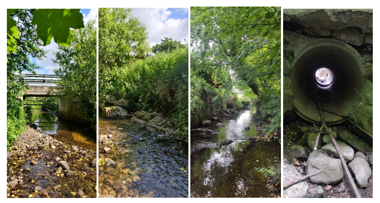
Apx Figure 5: Photographs of Brittas Stream and River Clodiagh showing from left to right the bridge over the River Clodiagh to the Integrated Constructed Wetland (ICW), the right bank of the River Clodiagh at the ICW, the informal flood wall on the left bank of the River Clodiagh in Area 2, Brittas Stream culvert with no flow. Photographs taken on 6<sup>th</sup> June 2024.