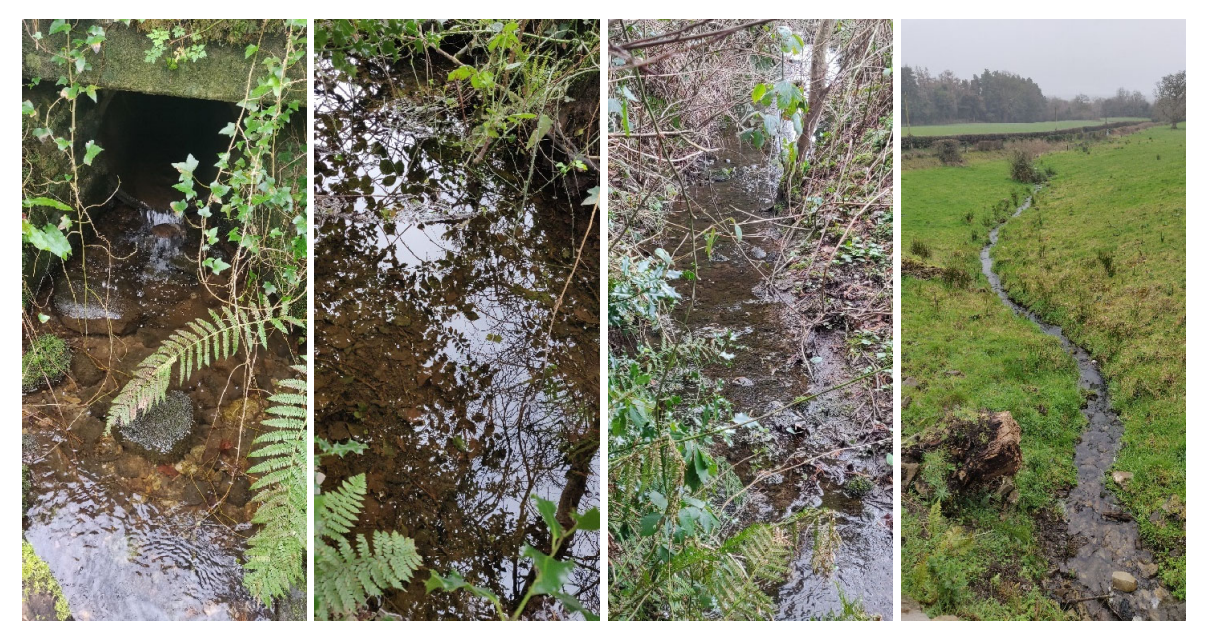
Apx Figure 4: Photographs of Brittas Stream showing from left to right the culvert outlet within the Proposed Scheme area, the stream habitat at the culvert inlet, the stream habitat c. 10m upstream of the culvert inlet and the stream upstream of the Proposed Scheme area. Photographs taken on 12<sup>th</sup> March 2024.