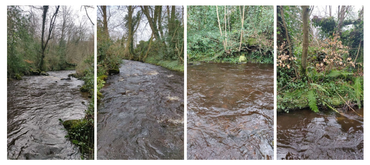
Apx Figure 2: Photographs of the proposed debris trap location in high flow. From left to right: upstream view, downstream view, right bank, left bank. Photographs taken on 12<sup>th</sup> March 2024.

Apx Figure 1: Photographs of a representative reach within the River Clodiagh, where macroinvertebrate, habitat and fish/crayfish habitat appraisal surveys were undertaken in 2021 and 2023. The left photograph shows the reach looking downstream, the central photograph shows the reach looking upstream the right photograph shows substrate within the reach. Photographs were taken on the 28<sup>th</sup> August 2023.