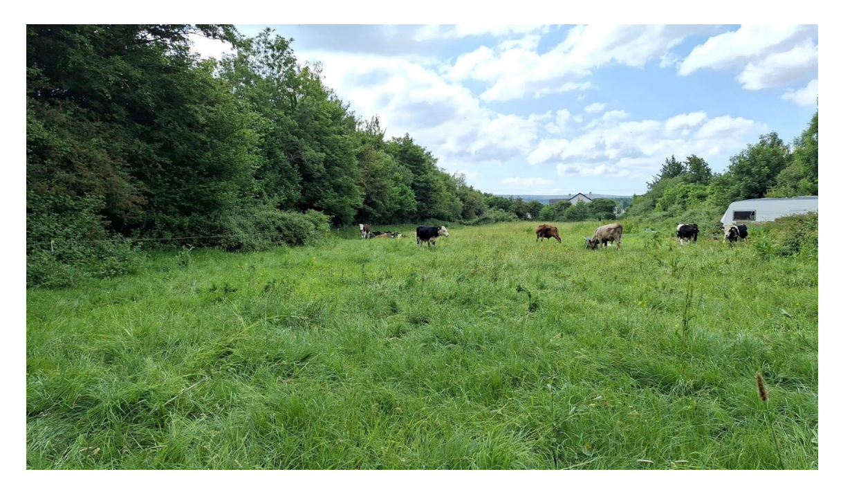
Apx Figure 9: Agricultural grassland, hedgerow habitat (right) and (mixed) broadleaved woodland (left) in Area 3. Photograph taken on the 6<sup>th</sup> June 2023.