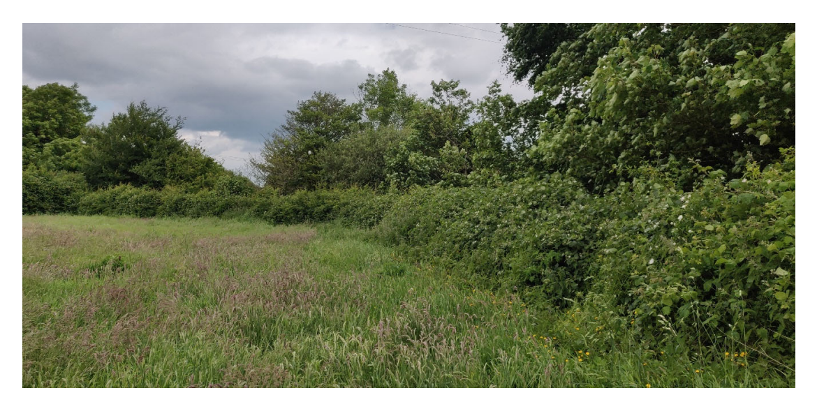
Apx Figure 8: Site compound in Area 2, showing hedgerow habitat (H9) along the left bank (looking downstream) of the River Clodiagh. Photograph taken on 6<sup>th</sup> June 2024.

Apx Figure 7: Photographs of Proposed Scheme area showing from left to right the bridge over the River Clodiagh to the ICW (looking west) and woodland habitat on the southern side of this access road (Area 3). Photographs taken on 6<sup>th</sup> June 2024.